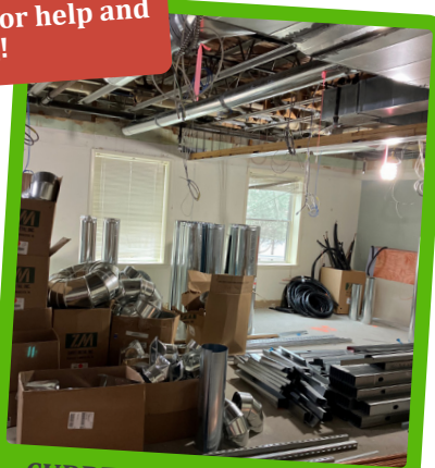
CURRENT: This duct work is going to keep us warm (or cool, weather dependent)