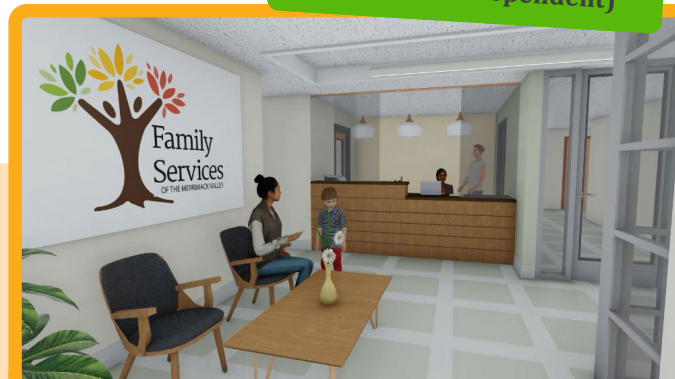
COMING SOON: warm & welcoming reception area